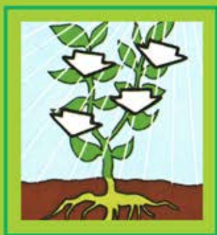
KILLS ON CONTACT