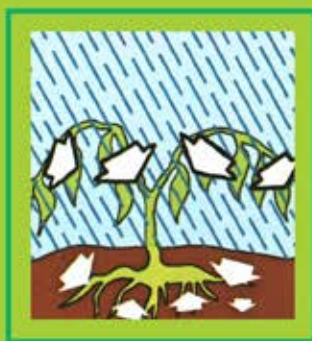
TRANSLOCATES THRU PLANT TO ROOTS