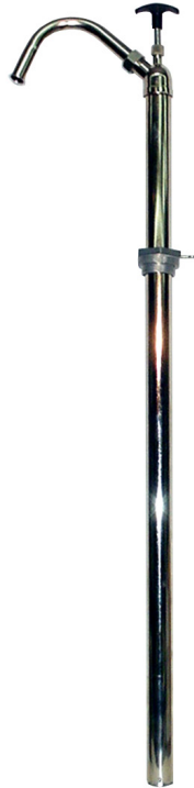
FOREMOST 8392 NICKEL PLATED DRUM PUMP (Not For Acids)

A light weight, economical drum pump for use with non-solvent type products. May be used with acids. Durable, rust free. Eliminates costly drum racks, saves floor space, gives long service. Can be adapted to fit 55, 35 and 20 gallon drums with 2" openings.