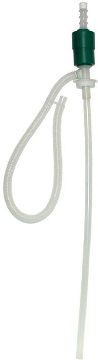
FOREMOST 8391 PLASTIC SIPHON DRUM PUMP

SPECIALTIES FOR MAINTENANCE AND SANITATION SINCE 1947