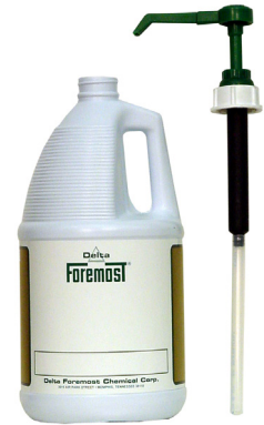
FOREMOST 8397 PLASTIC PUMP 1 oz. Stroke (Not For Solvents)

Eliminates costly drum racks, saves floor space.