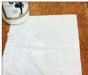
DROP WIPE ONTO STAIN