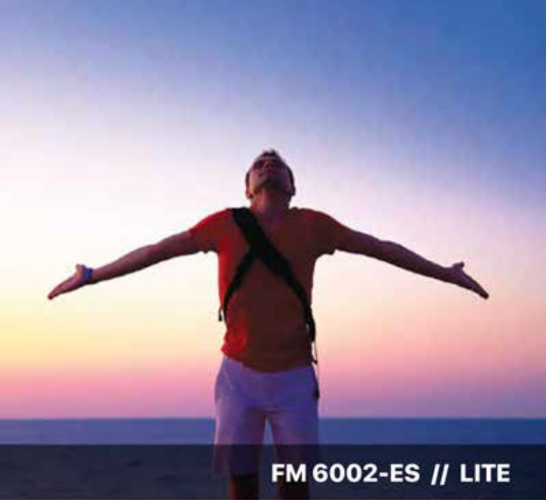
FM 6002-ES // LITE