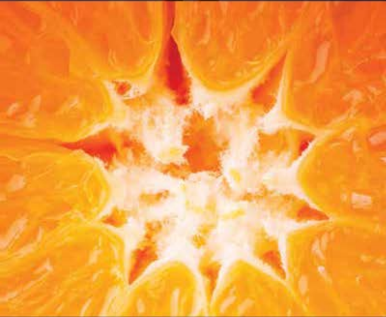
FM 6003-ES // CITRUS MIX