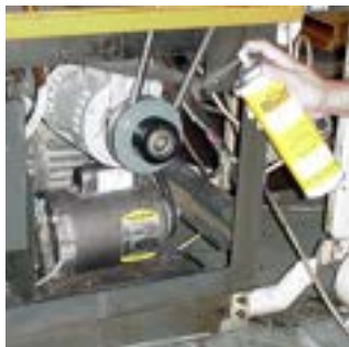
Motors and Generators

SPECIALTIES FOR MAINTENANCE AND SANITATION SINCE 1947