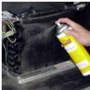
Cooling & Vending Machines