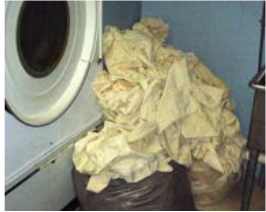
Most of these discards can be returned to service

RENTAL LAUNDRIES —All of the above, plus.