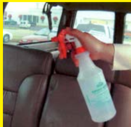
CAR RENTAL/FLEET PREPARATION

New Foremost Cinna Fresh Smoke Eater is a unique ready-to-use liquid which chemically neutralizes smoke and other obnoxious odors. Not a mask or cover-up, Smoke Eater is formulated for use in the most elegant of surroundings, yet destroys the toughest odors. Its pleasant fragrance is eliminated in time along with malodors leaving a fresh, odor-free atmosphere.