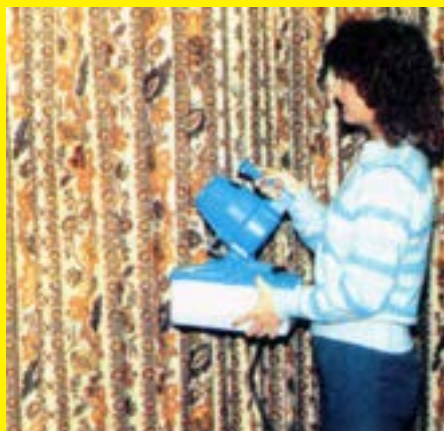
CAN BE USED IN MISTING OR FOGGING DEVICES