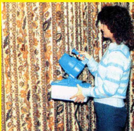
CAN BE USED IN MISTING OR FOGGING DEVICES