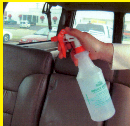
CAR RENTAL/FLEET PREPARATION

New Foremost Apple Spice Smoke Eater is a unique ready-to-use liquid which chemically neutralizes smoke and other obnoxious odors. Not a mask or cover-up, Smoke Eater is formulated for use in the most elegant of surroundings, yet destroys the toughest odors. Its pleasant fragrance is eliminated in time along with malodors leaving a fresh, odor-free atmosphere.