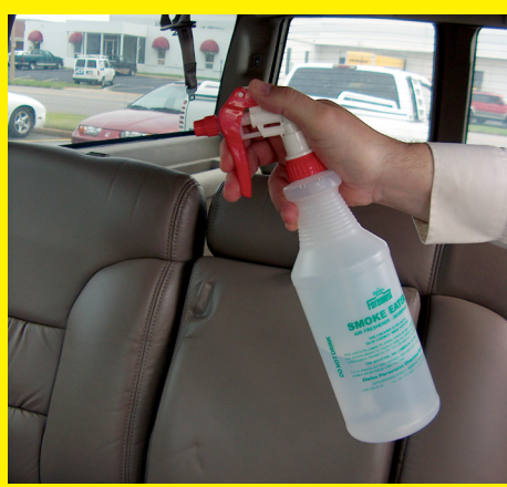
CAR RENTAL/FLEET GET READY

New Foremost Garden Breeze Smoke Eater is a unique ready-to-use liquid which chemically neutralizes smoke and other obnoxious odors. Not a mask or cover-up, Smoke Eater is formulated for use in the most elegant of surroundings, yet destroys the toughest odors. Its pleasant fragrance is eliminated in time along with malodors leaving a fresh, odor-free atmosphere.