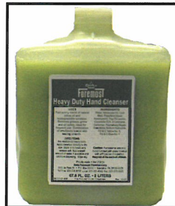
Pre-Packed 2-Liter Collapsing Cartridge

Packed in Cases of 12/2 Liter Cartridges