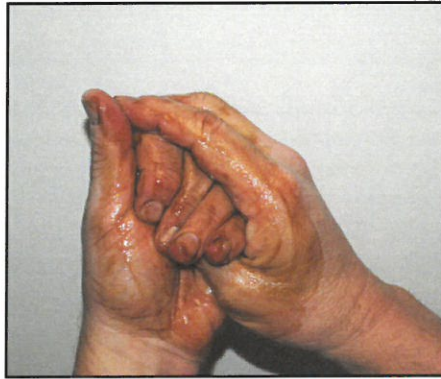
WORK INTO SKIN