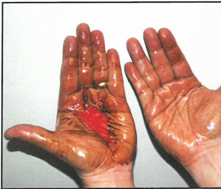
APPLY A SMALL AMOUNT