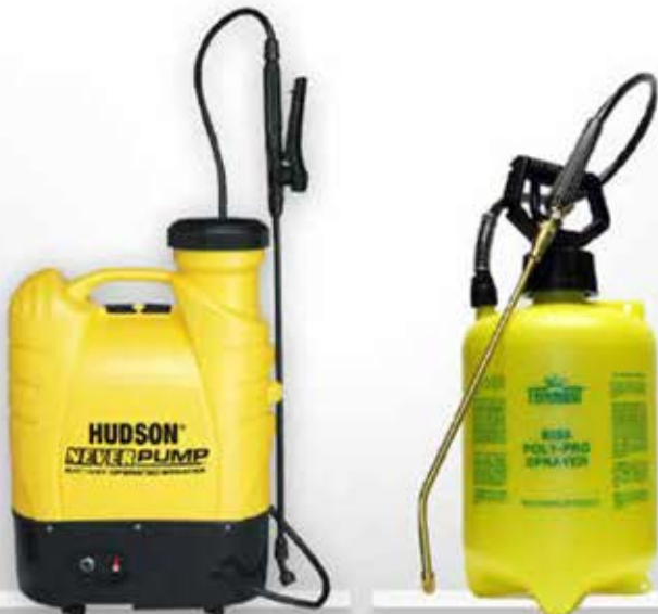
FM 8355 NEVERPUMP™ BAK-PAK® SPRAYER FM 8358 POLY-PRO SPRAYER

Dust Command makes sweeping easier and also, because of a built-in emulsifier, quickly releases when washed, mopped or scrubbed. Dust Command eliminates the need for old fashioned floor sweeps and the mess they leave behind.