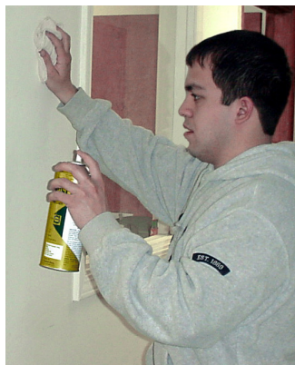
WOODWORK — WALLS

SPECIALTIES FOR MAINTENANCE AND SANITATION SINCE 1947