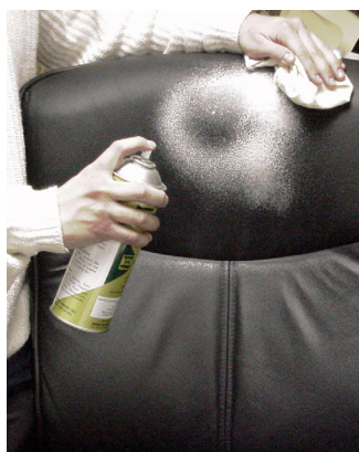
LEATHER & VINYL