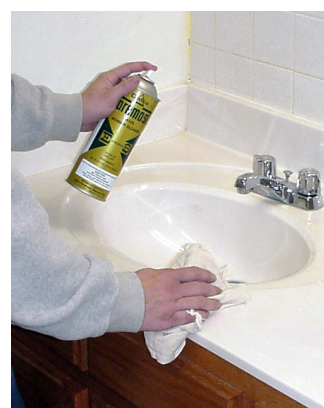
TUBS, TILE & FIXTURES

16 doz. or 4/48 cases 8 doz. or 2/48 cases 4 doz. or 1/48 case NET Wt. 1 lb. 6 oz. (Can Size 24 oz.)