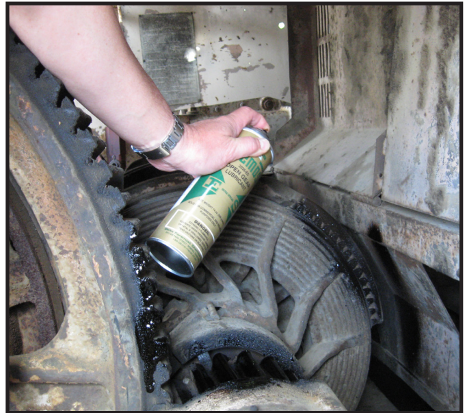
Just spray on - will not drop or throw off.