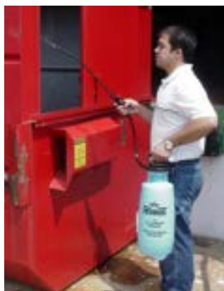
Ideal For Deodorizing And Degreasing Dumpsters.