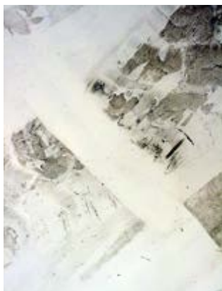
Quickly Dissolves And Removes Tire Burns From Traffic Areas.