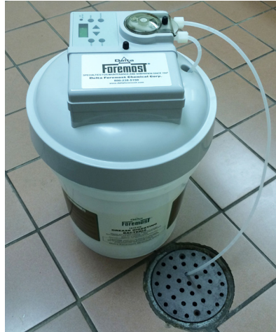
FM 1810-ES GREASE DIGESTING BACTERIA WITH FM 9590 DRAINMASTER PAIL PUMP

CONVENIENT, AUTOMATIC, ECONOMICAL, DISPENSING