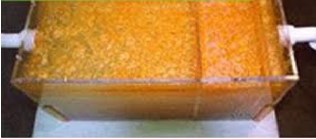
GREASE TRAP SOLIDS BEFORE