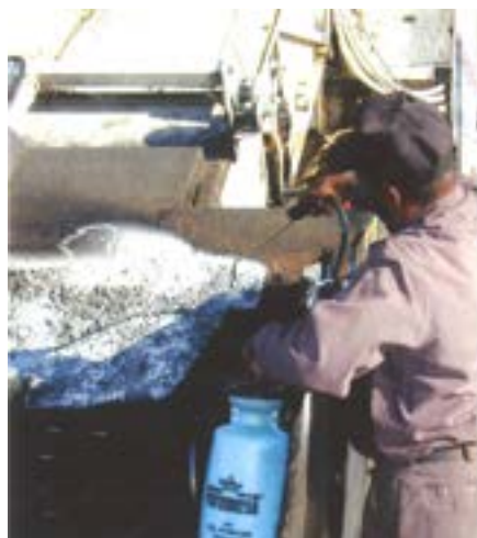
Apply by Sprayer