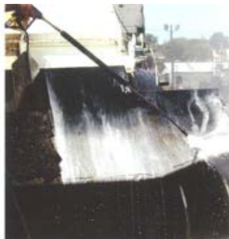
Flush with Water Pressure