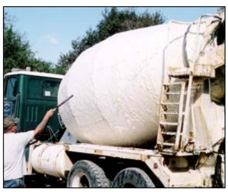
Faster more economical Fleet Cleaning when Foremost Jet-Foam Additive is used to hold cleaner on the vehicle for greater efficiency.