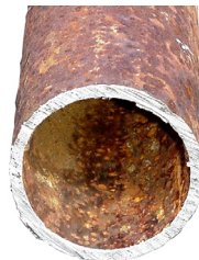
TOWER TREET STOPS corrosion and scale in towers and piping. 1/8 inch of scale thickness causes 10% energy loss!

NOTE In cooling water systems, scale, corrosion and fouling must be controlled in order to maintain proper efficiency and to conserve water. If untreated, permanent damage to the system can result. Foremost 1355-ES provides the distinct advantage of assuring protection of equipment, uninterrupted service and trouble-free performance.