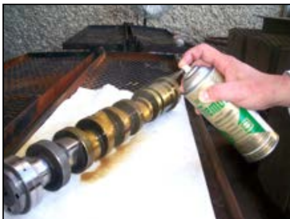
Easy Aerosol Application

SPECIALTIES FOR MAINTENANCE AND SANITATION SINCE 1947