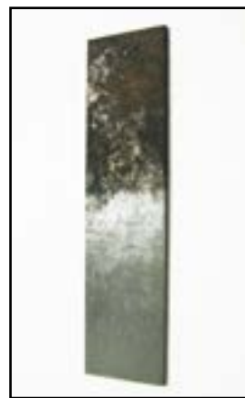
Treatment Removed After 6 Months