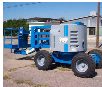
Ideal for cranes, cherry pickers, scissor lifts.