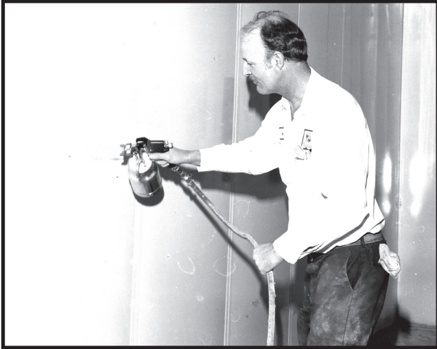
Quick and easy application

SPECIALTIES FOR MAINTENANCE AND SANITATION SINCE 1947