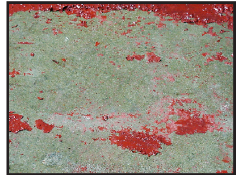
Scrape or Pressure Rinse Surface

VERSATILE —Safely strips most paints, adhesives, inks, and resins.