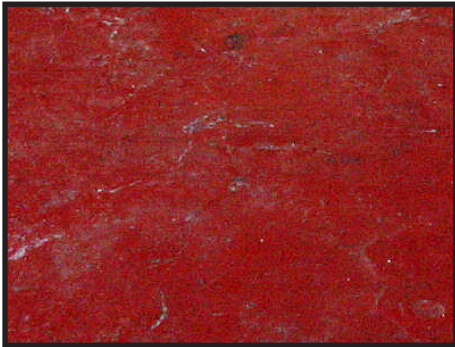
Apply to Surface